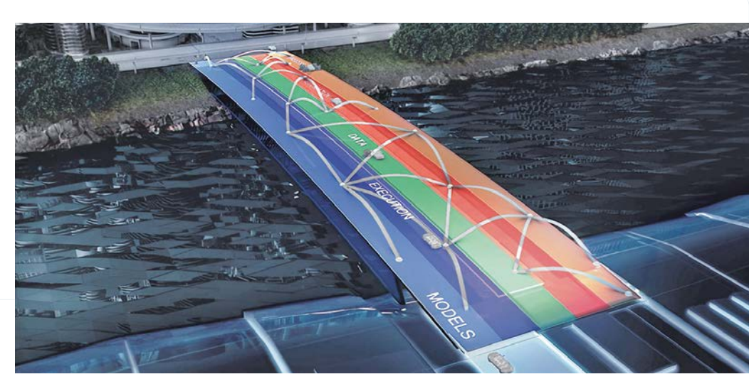
A common platform for calibration engineers (real to virtual)