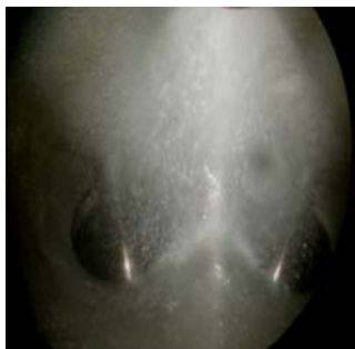
Spray blow back by pulsating airflow

Injection is observed by means of port spray endoscopy. The manifold is prepared with one access hole to accept endoscope and illumination. Spray propagation, spray impingement on walls, wall film formation and interaction with airflow is recorded in degree crank angle sequences.