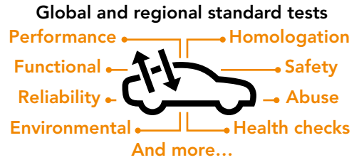
Vital global and regional test packages at your fingertips

A robust test plan for product development and/or homologation requires understanding of global and regional testing standards and methods (e.g. ISO, SAE, GB etc.). E-Library packages the know-how required by the respective standards together with AVL's experience into a set of complete test procedures. The knowledge transfer of test methodologies and sought-after comparative study of various global standards are as well provided.