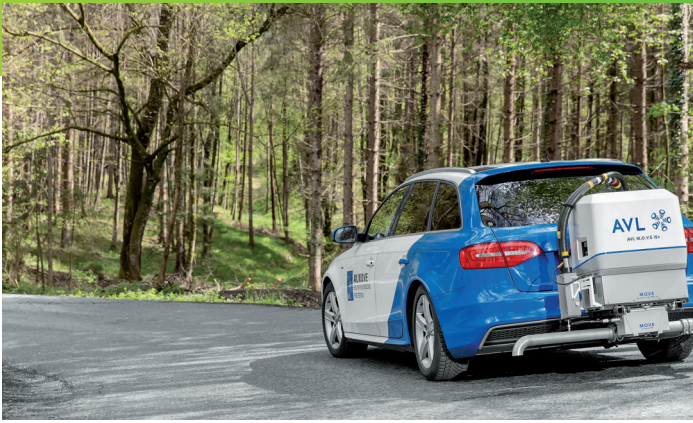
Installation on tow bar together with GAS PEMS iS+