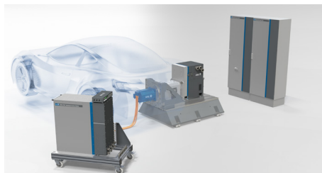
AVL SPECTRA Family™