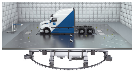
Vehicle Test Systems