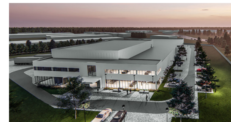
Complete Test Facilities

Testing-as-a-Service, Support and Application Services: 24/7, Available Globally.