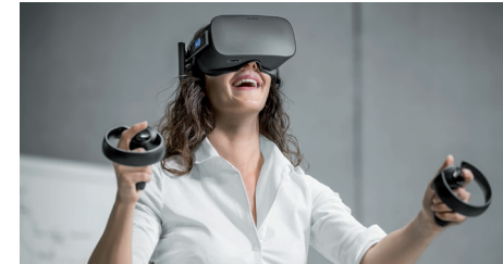
Virtual Reality Services