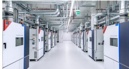
Battery Test Systems