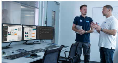
Testing and Analytics Software