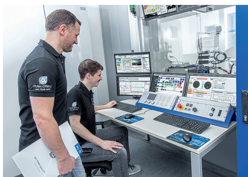
AVL Fuel Cell Testing